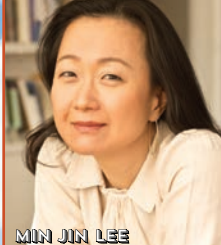
MIN JIN LEE